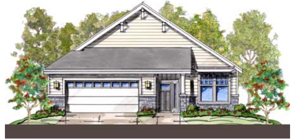
NW Craftsman Style Elevation

SQUARE FOOTAGE: 1,328 Sq. Ft. BEDROOMS: MASTER SUITE, BEDROOM/DEN BATHROOMS: 2 BATHROOMS OTHER ROOMS: FAMILY ROOM, DINING ROOM, LAUNDRY ROOM OTHER FEATURES: FAMILY ROOM WITH VAULTED CEILING AND FIREPLACE, OPEN KITCHEN, COVERED PATIO TYPE: 1 STORY, NW CRAFTSMAN STYLE ARCHITECTURE GARAGE: 2 CAR, INSULATED WITH FINISHED DRYWALL