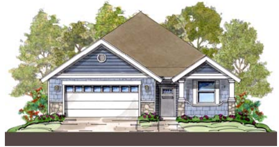
NW Craftsman Style Elevation

SQUARE FOOTAGE: 1,685 Sq. Ft. BEDROOMS: MASTER SUITE, 2 BEDROOMS BATHROOMS: 2 BATHROOMS OTHER ROOMS: LIVING ROOM, DINING ROOM, LAUNDRY ROOM OTHER FEATURES: FAMILY ROOM WITH VAULTED CEILING AND FIREPLACE, OPEN KITCHEN, SOAKING TUB IN MASTER BATH, COVERED PATIO TYPE: 1 STORY, NW CRAFTSMAN STYLE ARCHITECTURE GARAGE: 2 CAR, INSULATED WITH FINISHED DRYWALL