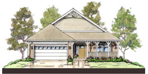
Cottage Style Elevation

SQUARE FOOTAGE: 1,887 Sq. Ft. WITH LIVING ROOM OPTION: 2,146 Sq. Ft. BEDROOMS: MASTER SUITE, 2 BEDROOMS BATHROOMS: 2 BATHROOMS OTHER ROOMS: FAMILY ROOM, DINING ROOM, BREAKFAST NOOK, LAUNDRY ROOM, OPTIONAL LIVING ROOM OTHER FEATURES: FAMILY ROOM WITH VAULTED CEILING AND FIREPLACE, OPEN KITCHEN, SOAKING TUB IN MASTER SUITE, COVERED PATIO TYPE: 1 STORY GARAGE: 2 CAR, INSULATED WITH FINISHED DRYWALL