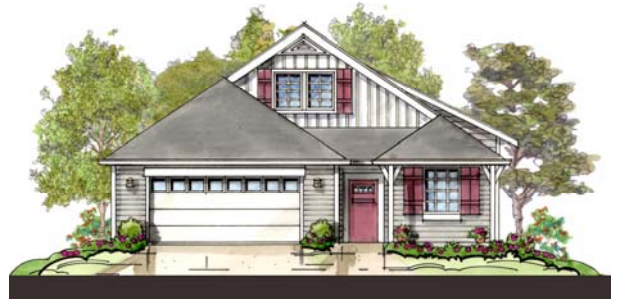
Larrabee with NW Craftsman Style Elevation

SQUARE FOOTAGE: 2,779 Sq. Ft. (MAIN FLOOR 1,856, UPPER FLOOR 923) BEDROOMS: MASTER SUITE, 3 BEDROOMS BATHROOMS: 3 BATHROOMS OTHER ROOMS: GAME ROOM LOFT, LIVING ROOM, DINING ROOM, LAUNDRY ROOM OTHER FEATURES: GREAT ROOM WITH VAULTED CEILING AND FIREPLACE, OPEN KITCHEN, LOFT SPACE, SOAKING TUB, COVERED PATIO TYPE: 2 STORY WITH MAIN FLOOR MASTER GARAGE: 3 CAR, INSULATED WITH FINISHED DRYWALL